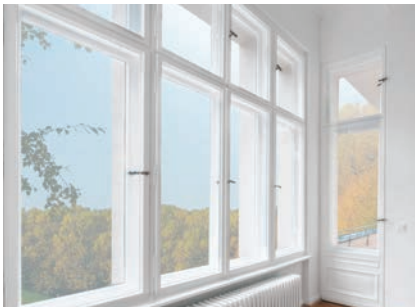
WOOD WINDOWS & DOORS

Our products deliver this optical feature and by use of well-proven and documented technologies we ensure that your valuable coated wooden elements are provided with an extended service life and well protected against degradations from natural weathering, UV radiation, humidity, mould and fungal attack in various climate zones around the world.